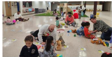
The TotalTek Team playing with the kids and their new toys.

We understand that our ultimate success is based not only on the business results of our clients, but also on the success and fulfilment of our consultants and on the health and wellbeing of our communities. To this end, we support the communities in which we live and work by proactively identifying and volunteering in civic and charitable activities. In addition to being a profitable business, we aim to make a difference in the lives of those around us, including neighbors, co-workers and our affiliates.