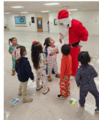
Christmas with the Kids

ST. ANTHONY'S PRESCHOOL & DAYCARE ~ MILWAUKEE, WI